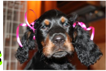
Charity 9 weeks old Legacy's Daughter